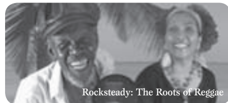
Rocksteady: The Roots of Reggae