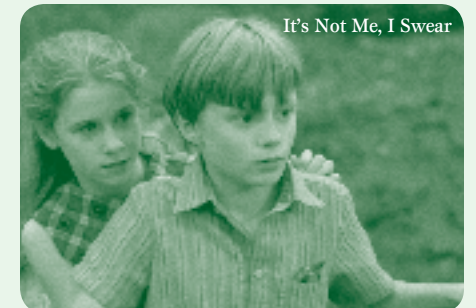
It's Not Me, I Swear

Jury Award: "Original, funny, provocative, and deeply moving."