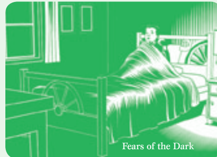
Fears of the Dark

An inventiveness that's never less than mesmerizing... exhibiting an astonishing range of styles." (New York Times)