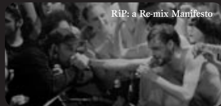
RiP: a Re-mix Manifesto

"A knockout. RiP is a dazzling frontal assault on how corporate culture is using copyright law to muzzle freedom of expression." (MacLean's)