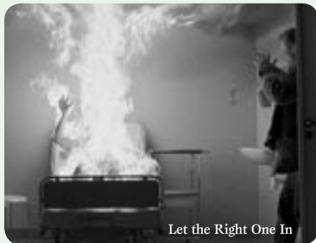
Let the Right One In

"LET THE RIGHT ONE IN not only re-energizes vampire cinema, this is one of the best pictures of 2008." (Brian Orndorf)