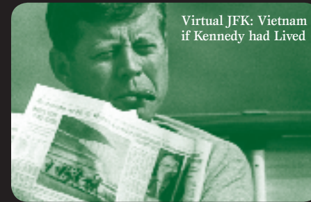
Virtual JFK: Vietnam if Kennedy had Lived

" VIRTUAL JFK ponders the mystery of the Kennedy personality mainly as manifested during his televised press conferences – radiating star power, the coolest man in the room disarms adoring tweedy reporters with his dry martini wit... Masutani's no-frills, largely black-and-white production is as evocative of early-'60s masculine styles as any episode of Mad Men ." (J. Hoberman, The Village Voice )