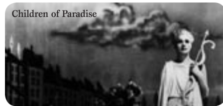
Children of Paradise

Amazingly, the film was produced over a two-year period in virtual secrecy, without the knowledge of the Nazis then occupying France, who would surely