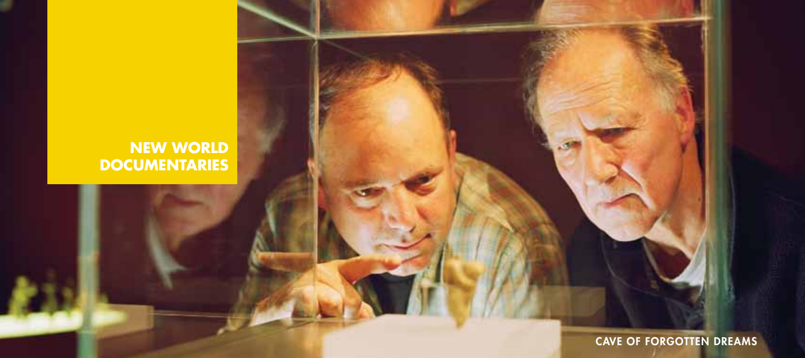
CAVE OF FORGOTTEN DREAMS