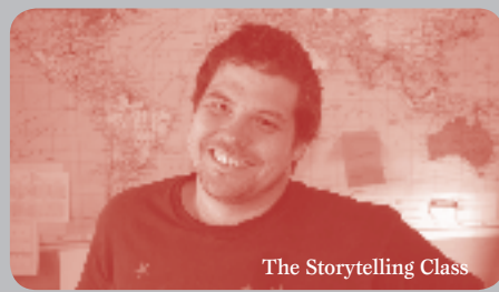
The Storytelling Class