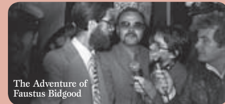
The Adventure of Faustus Bidgood