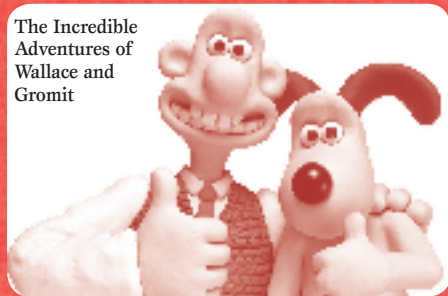
The Incredible Adventures of Wallace and Gromit

Three of their best stories featuring the hilarious stop-motion animated adventures of inventor Wallace and his dog Gromit as they face the world in Nick Park's ingenious, short films – A Grand Day Out , The Wrong Trousers and A Close Shave .