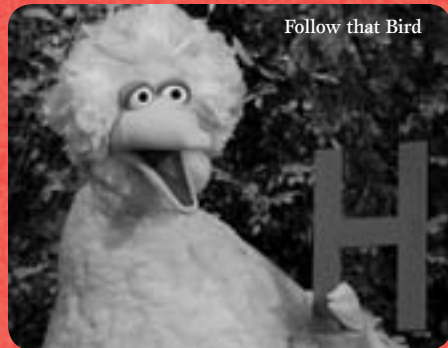
Follow that Bird

To mark the 40 th Anniversary of the best loved children's television show of all time, we present Sesame Street's beloved Big Bird in the classic film Follow That Bird . This film features all of your favourite Sesame Street characters – Kermit, Oscar, Bert, Ernie and the cookie monster – in the story of Big Bird's cross country adventures to get back to Sesame Street.