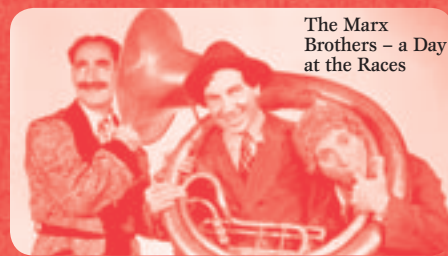
The Marx Brothers – a Day at the Races

One of the few Marx Brothers classics to receive an Oscar nomination and one of their best – featuring Groucho as Dr. Hugo Hackenbush, doing some of their best routines in the famous “tootsies footsie ice cream” scene and the “wallpapering to the wall” scene.