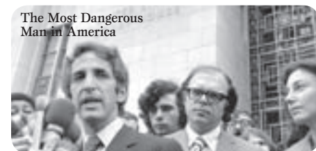
The Most Dangerous Man in America